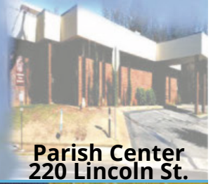
Parish Center 220 Lincoln St.

Oldest Catholic Parish in North Alabama—Established 1861