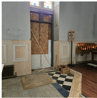
Altar step is being rebuilt.