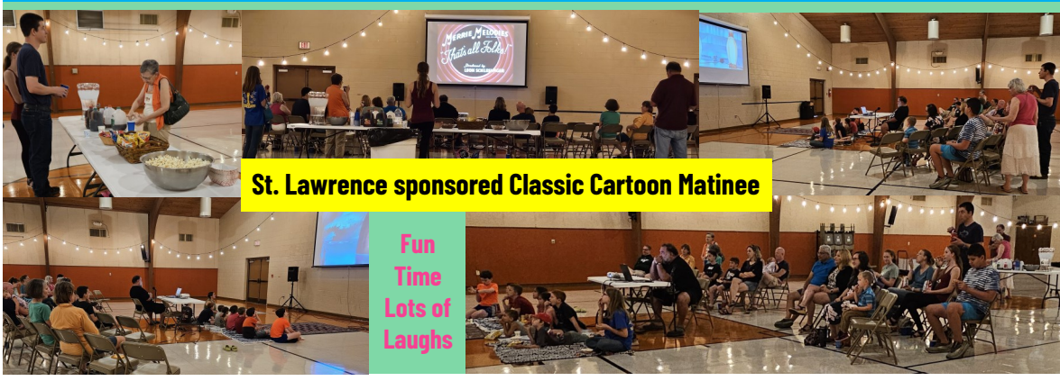
St. Lawrence sponsored Classic Cartoon Matinee