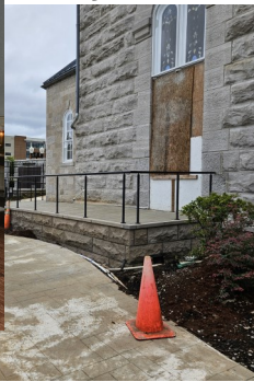
Railing is installed.

Damon & Beth Beck are parishioners who built the door with white oak and it is eight quarters thick. The door is currently at the painters getting primed.