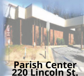
Parish Center 220 Lincoln St.

Oldest Catholic Parish in North Alabama—Established 1861